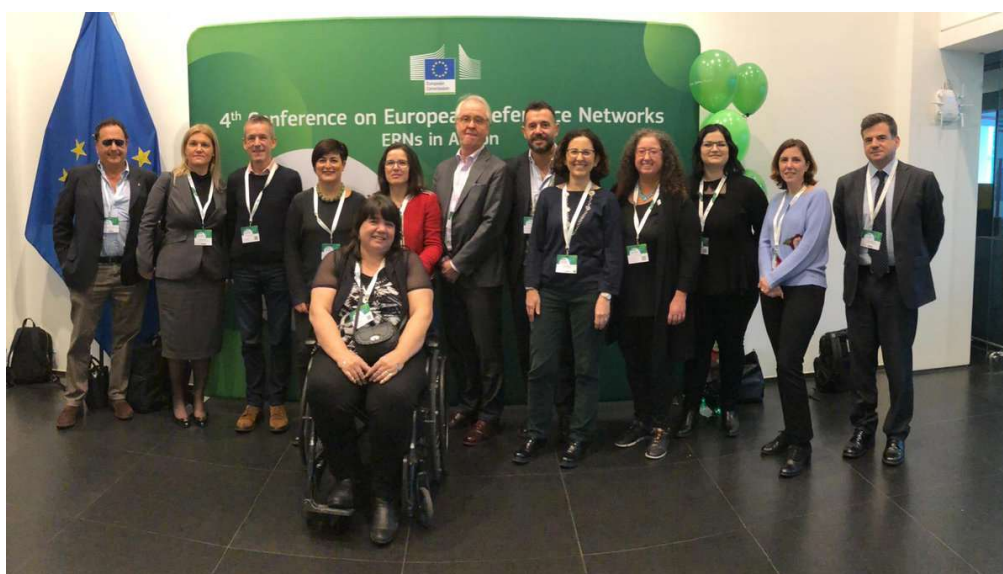
The ERN ReCONNET delegates at the 4 th ERNs conference